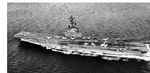
USS Kearsarge CV-33