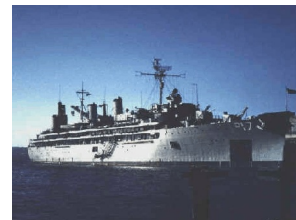
USS Piedmont AD-17

www.spaciousskies.us/HospHome/ships.html