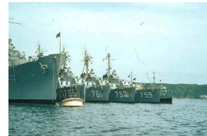
USS Dixie AD-14