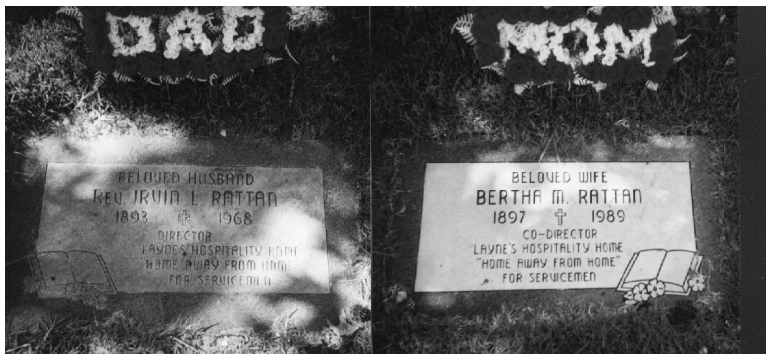
Rattans' burial site, El Camino Memorial Park, San Diego, California.

➤ Directions to Branson Hills Assembly of God , which is about 3 miles north of Branson: From the south: Go north on Highway 65; get off at Bee Creek Road, then turn right. Follow about a mile, and Church Road is on the left; go up the hill. From the north: From Highway 65, turn off at the "F" Highway exit. Turn left (go over Hwy. 65) and go to outer frontage road. Turn right (southbound) and stay on it until you get to Church Road; go up the hill. In both cases , you'll also see Cedar Cliff Motel and the Mormon church, as well as Branson Hills A/G.