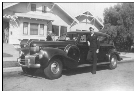
1939 Chrysler Imperial Limo, photo 1951 www.spaciousskies.us/HospHome/chrysler_limo.html