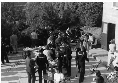
Lower Patio, 1952