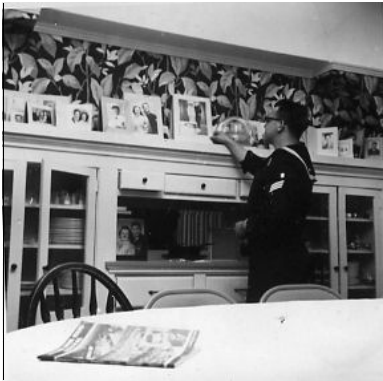
Dining Room, 1951